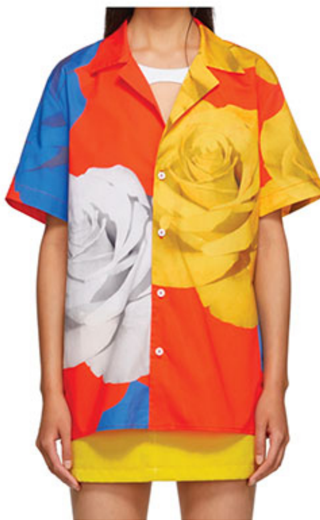
Print shirt by Anton Belinsky at Ssense

Historic public market with a dozen boutiques featuring "made in Québec" creations.