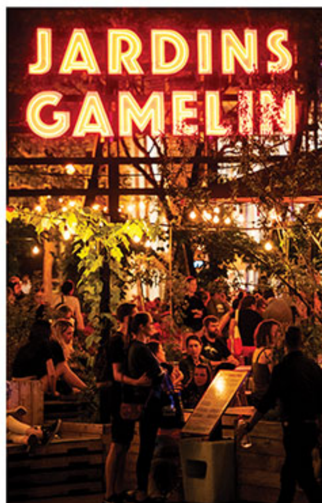
Place Emilie-Gamelin near Berri Uqam metro station

A cultural and festive space, hosting free daily activities and events for all.