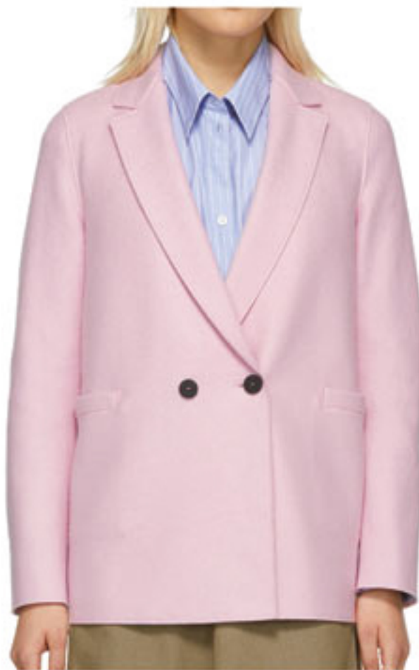
Pink wool jacket by Harris Wharf London at Ssense

Historic public market with a dozen boutiques featuring "made in Québec" creations.