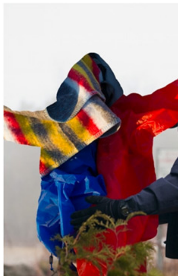
Detail of a piece by Michel Huneault exhibited at the Phi Centre all of May.

A farmers' market located in the Saint-Henri area with a huge variety of fresh food shops.