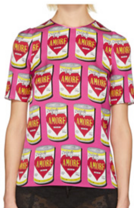
Sunglasses by Alexander McQueen, t-shirt by Dolce & Gabbana at Ssense