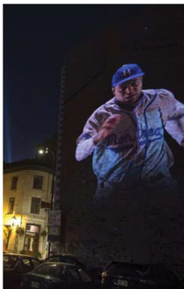
Cité Mémoire projection in Old Montreal.

An outdoor family event dedicated to discovering and celebrating the joys of winter. Saturdays and Sundays from January 20th to February 11th.