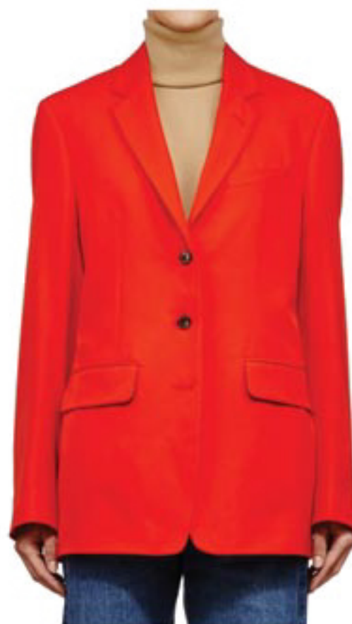
Berman jacket by Dries Van Noten at Cahier d'Exercices.

Historic public market with a dozen boutiques featuring "made in Québec" creations.