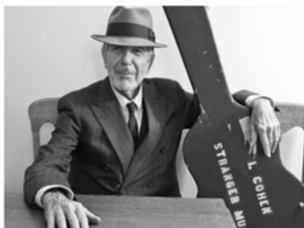
Leonard Cohen at the MAC.