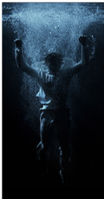
Bill Viola at DHC Art all of November.

Ride around the streets of Montreal on a hybrid bike with a professional guide.