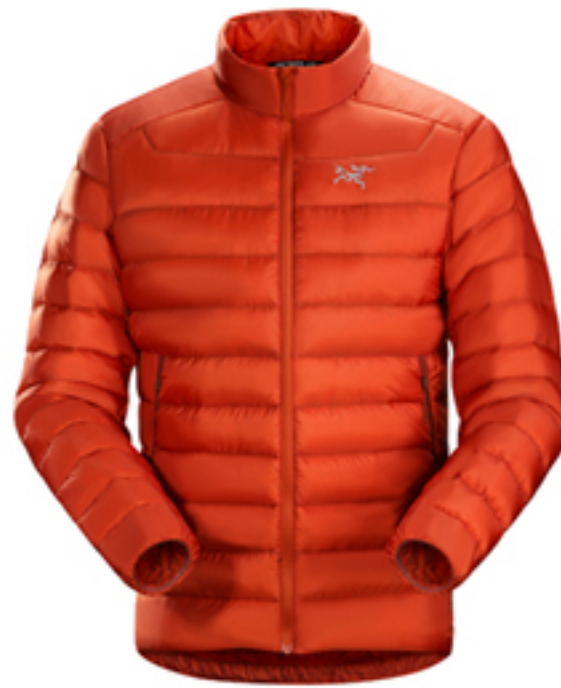
Arc'teryx jacket and CYDWOQ boots at U&I

From stylish to strange, you'll find it all on the boulevard when it comes to clothing, accessories and other trendy products.